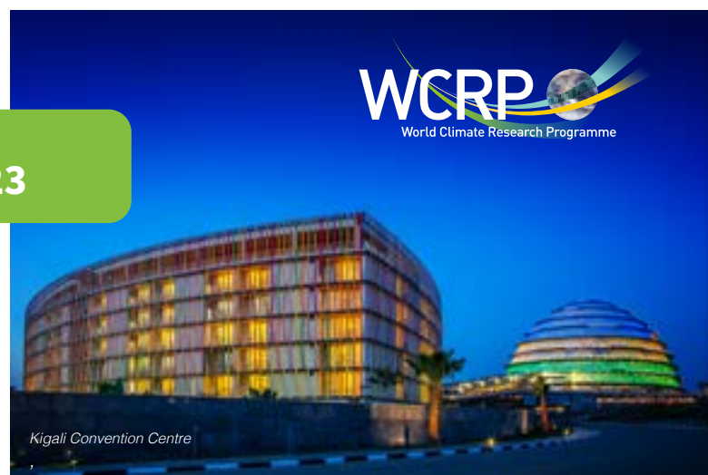
Kigali Convention Centre